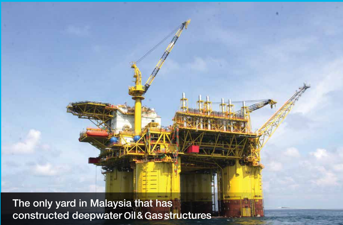
The only yard in Malaysia that has constructed deepwater Oil & Gas structures