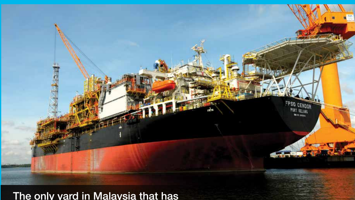
The only yard in Malaysia that has completed FPSO & FSO conversions