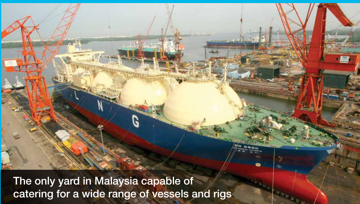
The only yard in Malaysia capable of catering for a wide range of vessels and rigs