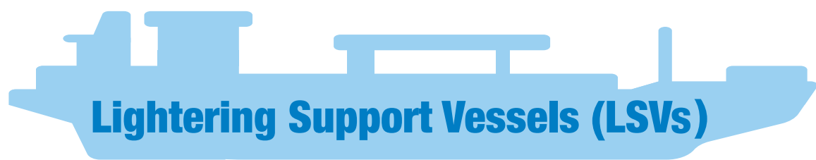
Lightering Support Vessels (LSVs)