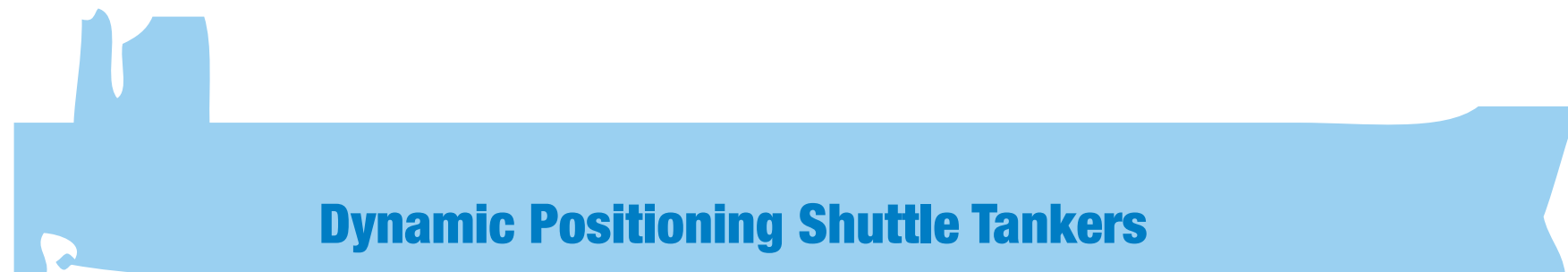
Dynamic Positioning Shuttle Tankers