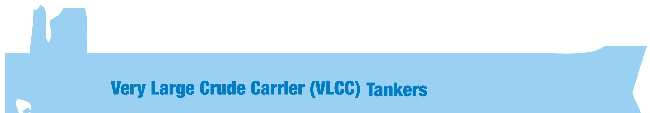
Very Large Crude Carrier (VLCC) Tankers